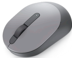
DELL MOBILE WIRELESS MOUSE | MS3320W

Work seamlessly with dual mode connectivity (2.4GHz wireless or bluetooth) and 36 months battery life.