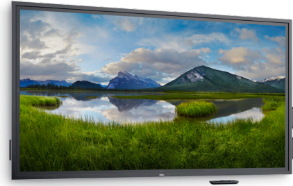
DELL 75 4K INTERACTIVE TOUCH MONITOR | C7520QT

Secure, charge and transport up to 36 laptops all in one place, with a cart that easily rolls from one classroom to the next.