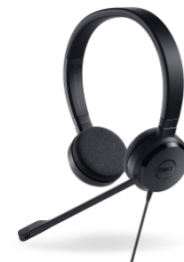
DELL PRO STEREO HEADSET - UC150

Work seamlessly with dual mode connectivity (2.4GHz wireless or bluetooth) and 36 months battery life.