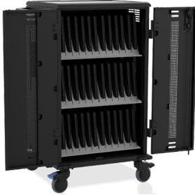
DELL COMPACT CHARGING CART | 36 DEVICES

Secure, charge and transport up to 36 laptops all in one place, with a cart that easily rolls from one classroom to the next.