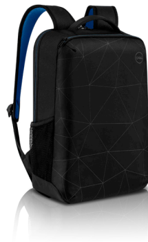
DELL ESSENTIAL BACKPACK 15 | ES1520P

Experience great audio clarity with the Dell Pro Stereo Headset - UC150. And, get started right away with plug and play without having to download any software.