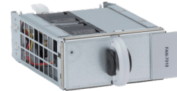
Arista 7010T hot swap and reversible fan module