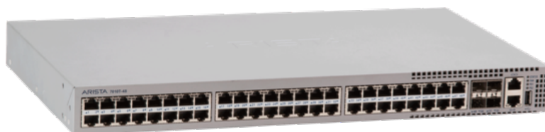
Arista 7010T-48: 48 port 10/100/1000 and 4 port 10GbE Switch

Consuming under 52W the 7010T are extremely power efficient at less than 1W per port. Built in power redundancy and customer reversible redundant fans allows cooling airflow in either forward or reverse direction in a single system.