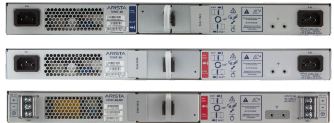
Arista 7010T Rear View - reversible airflow, AC & DC