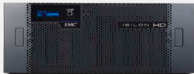
EMC Isilon HD400

The rapid growth of unstructured data combined with increasingly stringent compliance requirements is resulting in a growing need for efficient data archiving solutions that can store and protect data for long-term retention.